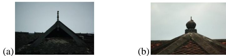
Fig. 4: (a) Tunjuk Langit .Jenis batang ; (b) Tunjuk Langit.Jenis bulat .