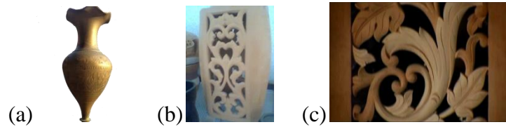
Fig. 6. (a) metal work; (b) pottery ware; (c) woodcarving

numbers of one, three, five, and so on depending on the surface of the carving. The patterns usually comprise leaves splits into two, three and five. The motifs used are usually from plants which are vital in Malay society; having aesthetic, medicinal and nutritional values. Examples are sesayap leaf , telinga kera , telipot , kerak nasi , etc. These motifs are commonly used in Metalwork (Fig. 6a), Pottery (Fig. 6b), but mostly used in wood carving (Fig. 6c).