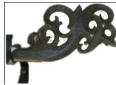
Fig. 8. Three dimensional motifs form

However, three-dimensional motif form emphasizes the forms that can be appreciated from all angles (Fig. 8). These motifs are usually found in ceremonial items, agricultural implements, household equipments and row of post ( tiang larik ) in traditional Malay house.