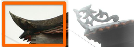
Fig. 2. Images of ekor itek and sulur bayung crept at the hip roof