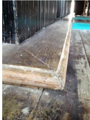
Fig. 1: Image of bendul wooden frame

and served to separate the different portions of the house such as the veranda, the main house, the passage way and the kitchen (Wan & Abdul, 2011).