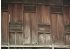
Fig. 9. Dinding janda berhias