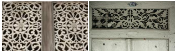
Fig. 7. Tebuk tembus to facilitate ventilation.

Motif carving technique is usually based on two forms; two dimensional or three dimensional. Two dimensional motifs are usually associated with flat surface which can only be seen from one angle. This type of motifs is commonly used as wall decorations, door-leaf, and louvered screens in traditional Malay buildings. An example of this is tebuk tembus wood carvings and is usually found above the entrance between two different functional spaces. It is also available in the wall for ventilation and natural lighting. The carving often have floral motif of scented flowers (Fig. 7).