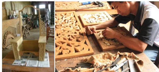
Figure 11: Malay wood carver

According to Haziyah et al. (2012), Malay wood carving is a reflection of the beauty of the soul and culture of Malay society which can be discerned from the arrangement and composition of the leaf, stalk, flower, fruit, and tendrils in a particular carving. The ornaments found in Malay carvings are also connected with particular meanings and stories associated with the carvings