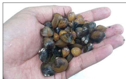
Figure 1: Fresh “etak” (before smoked) sampled in Kelantan, Malaysia.

general, there is a growing demand for Asian clams in Malaysian markets especially in Kelantan. They consume smoked “etak” as a snack. The preparation of smoked “etak” will begin with marinating process followed by smoke process before it ready to be consumed.