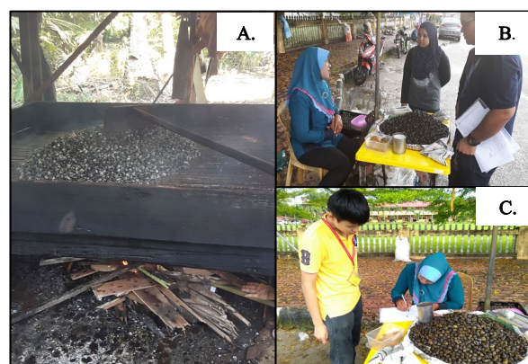
Figure 2: The smoking and selling of “etak”. A: the smoking platform of “etak”; B and C: the selling of “etak” along the roadside in Pasir Mas, Kelantan.

Then, the solutions were continued filtered by using syringe filter before transfer into 50 mL of falcon tube and follow up with dilution with deionized water. The filtrate was stored in refrigerator at 20°C before undergoing further analysis. All of the samples were analysed for Cr, Mn, Zn and Cu using a Perkin Elmer PinAAcle 900F Atomic Absorption Spectrometer (AAS). The method was suggested by previous study by Wong et al. (2017).