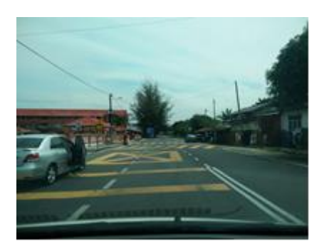
Figure 5- Parents Parking their car on zebra crossing

There were 3 hazards indicating the high risk; namely (1) school located on the main road, (2) parents parking or blocking zebra crossing and (3) pedestrian bridge.