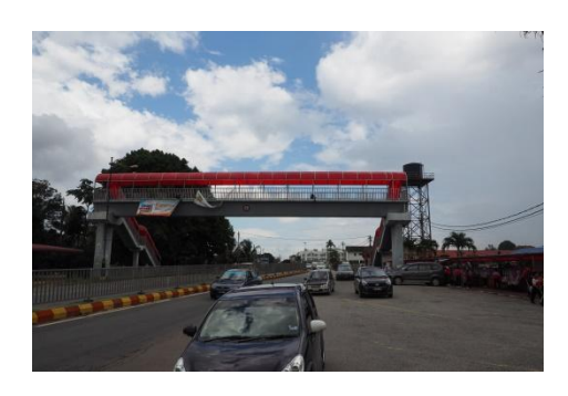
Figure 6 (b) - Pedestrian bridge far from the school gate.

In Malaysia, the pedestrian is one of the elements in the system paths. Pedestrian bridges are built, for the use of pedestrians to cross busy roads teeming with vehicles. In addition, pedestrian bridges can be considered as a tool or crossing facilityin the safest and most efficient manner. It provides segregation between pedestrians and vehicles on the road. But Hidayati found out that the impact of a school located on the main road was related to the presence of side friction. This stems from private vehicles stopping or parking and public transport stopping around the school<sup>28</sup>.