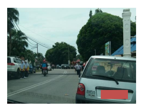
Figure 7 (b) - Students running at the roadside.

More than half of the reported pedestrian collisions involved the presence of bicycle, and older boys were most at risk of experiencing severe pedestrian injury. The high proportion of running and crossing and not looking before crossing showed that children were mentally immature and lacked concentration, and they could not react correctly to traffic condition<sup>30</sup> Children who walk to or from school were younger and showed riskier road-crossing behavior, although children who accompanied by another person tend to have higher pedestrian collision severity.