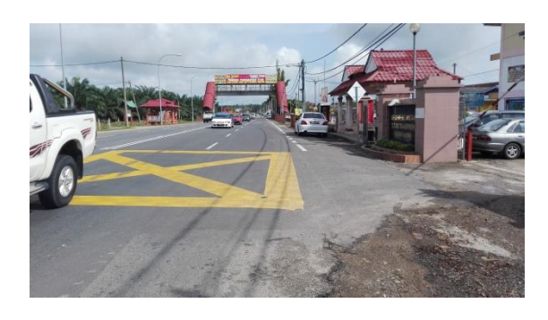
Figure 6 (a) - School behind the main road and pedestrian bridge located far from school gate

Clearly identified the purpose of a person crossing the road or walking in general, were not directly provided information in planning to provide pedestrian crossings and space in certain areas<sup>25</sup>. WHO stated that the design of pedestrian walkways should be based on consumer characteristics along the route<sup>27</sup>. For example, walking in the area of the elderly group would be different than walking in the area of school children.