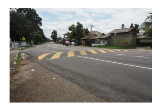
Figure 8 - Road Safety Measures or School Zone

Figure 7-a and Figure 7-b show parents waiting for their children outside the school area and the children's behavior on the roadside. In urban areas of Malaysia, school areas areteeming with vehicles, for example, school buses and cars especially during peak times such as the start and end of school session<sup>11</sup>. The situation where parents drive and wait for their children entering or leaving school could cause traffic congestion, especially during peak times.