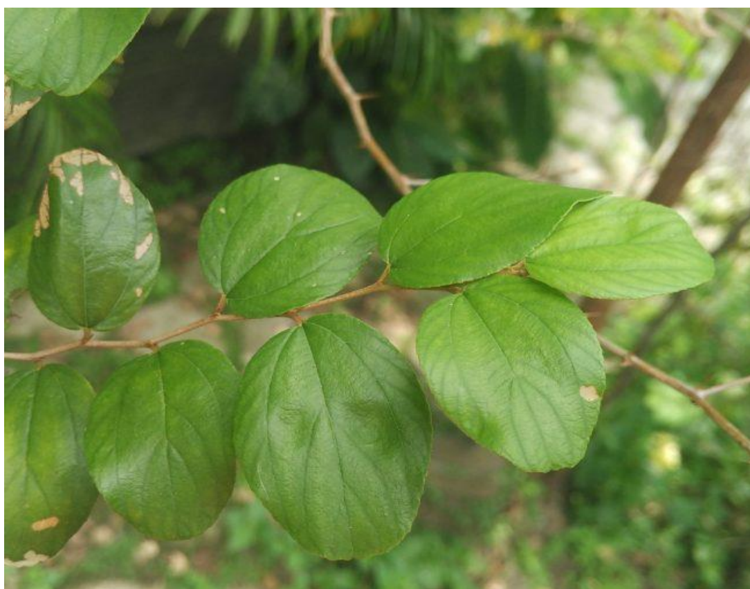
Figure-1. The bidara leaves.

The way of treatment is also different from a biomedical therapy as in the understanding of the locals invisible creatures ‘disturb’ the people. Therefore, the patients must be treated in a culture-specific way. The healer usually recites special verses of the Qur’an that are considered as effective in weakening the disturbing jinn . Furthermore, the patients should also take a bath in water in which leaves of the bidara tree (bot. Ziziphus Mauritania ) were added [7]. These leaves (see Figure 1) are well-known among Islamic scholars.