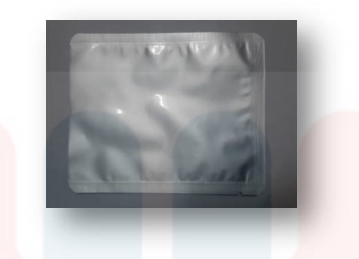
Figure 2.2: Retort pouch packaging