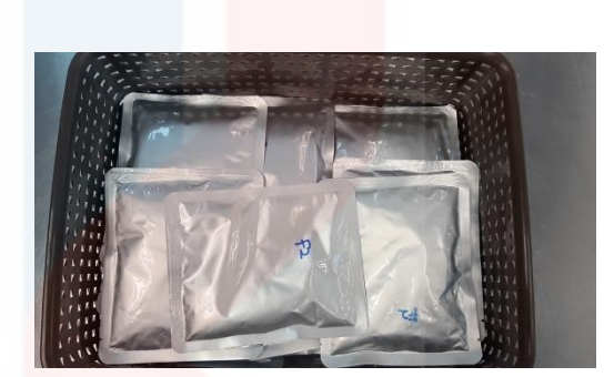
Figure A 2: Retort processed Pleurotus pulmonarius soup