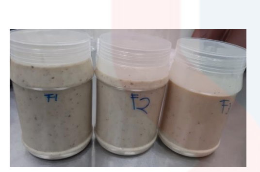
Figure A 1: Pleurotus pulmonarius soup