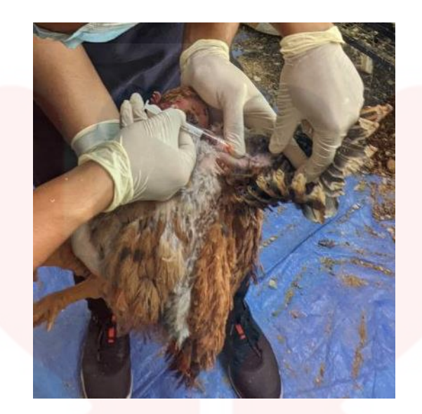
Figure 3: Blood collection via the jugular vein