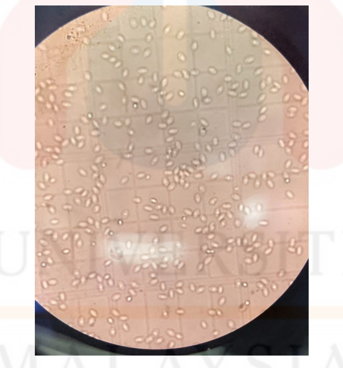
Figure 4: Erythrocyte count via microscope.