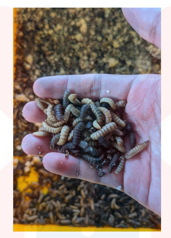
Figure 1: Black Soldier Fly Larva<mark>e</mark>