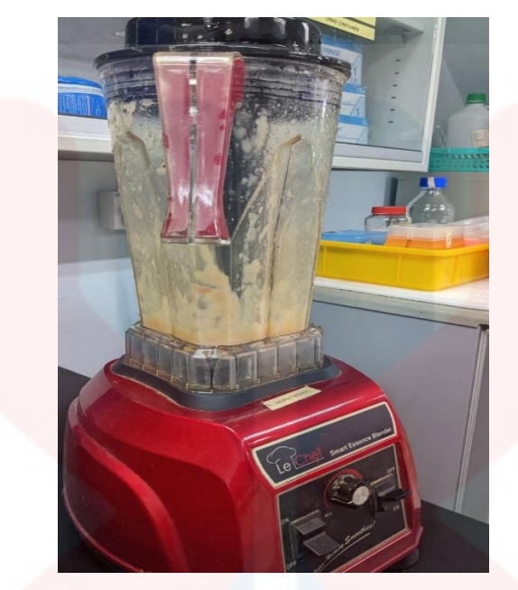
Figure 5: Chicken breast meat homogenised using in a homogenizer