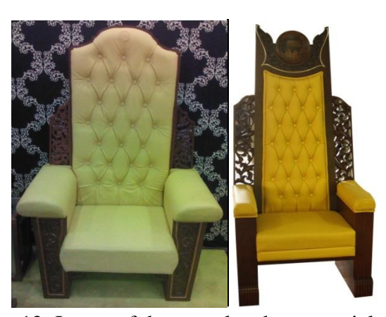
Figure 12: Image of the completed ceremonial chairs

themselves(Haziyah et al, 2012). Also, the beauty in wood carving represents what can be appreciated in the art of wood carving in thepast and the expression shown through wood carvings represent character and culture of the Malays in Malaysia. Therefore, integrating such tangible heritage in home furniture design (Fig. 12) is an approach towards creating products with emotional and spiritual contents.