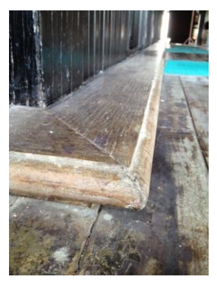
Fig. 1: Image of bendul wooden frame

and served to separate the different portions of the house such as the veranda, the main house, the passage way and the kitchen (Wan & Abdul, 2011).