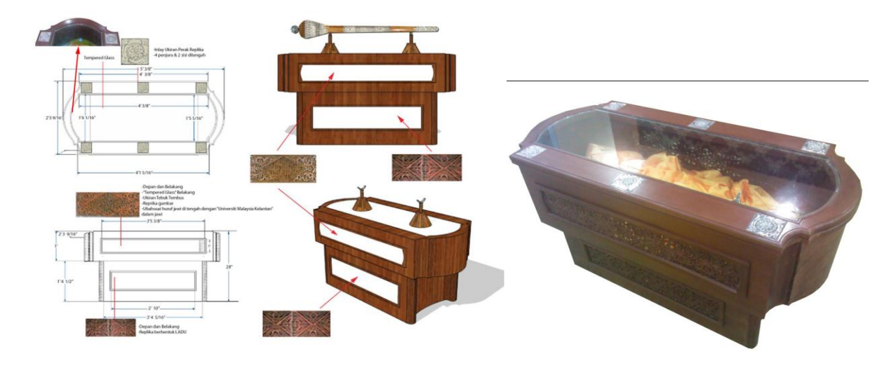
Figure 13: A stand for ceremonial staff (mace)

Figure 13 is an illustrative diagram and an image of a stand for ceremonial staff (mace). The design also features some tangible heritage of Malay culture. These include the gunungan shape at the two ends and the tebuk tembus motifs used to decorate the surface of the furniture.