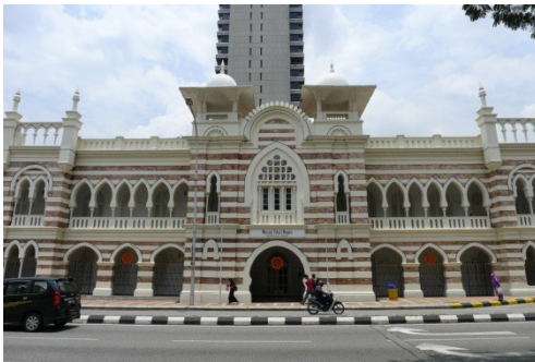
Fig. 3: Army Museum

As for the selection of the case studies, the types of museum with specific material collections were chosen because it is easier to regulate the museum indoor climate when most of the objects are of the same materials as they require more or less similar indoor climatic conditions. This means they require less complicated systems so that the use of passive building features can be fully utilized. Two museums are chosen as case studies with each museum dedicated to each type of materials. The collections of objects of the first case study, the Army Museum "Fig. 3" consists of mainly inorganic materials (metals) while the second case study, the National Textile Museum "Fig. 4" is of organic materials (textile).