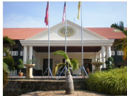
Fig. 4: National Textile Museum