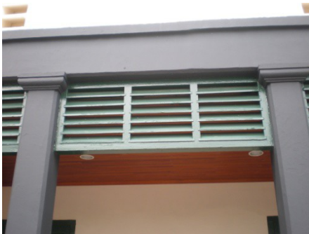
Fig. 1: Shading device.