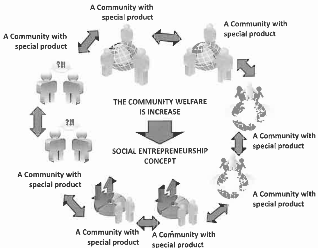
Figure 2. Increased well-being of society through social entrepreneurship

Fig. 2 above shows the development of social entrepreneurship project in a community will provide opportunities for surrounding communities to develop their entrepreneurial as well. Each community can be linked together to produce products or products produced by supporters of other communities. Connectedness or interdependence between one community to another community will memperantas progress of a community, as well as diversification of products in the community.