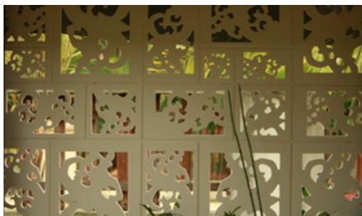
Figure 3a: Perforated walls in building design