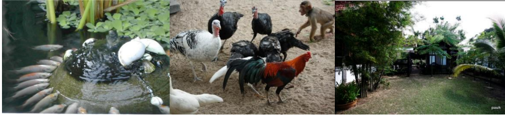
Figure 4: Natural elements integrated into a living space