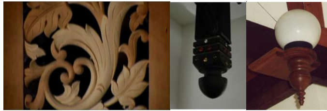
Figure 5: Traditional aesthetic elements integrated to building