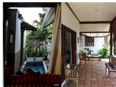
Figure 3b: Top and side openings in a building