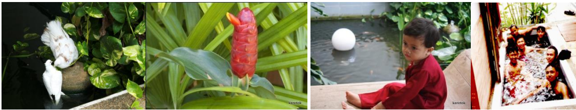
Figure 6: Natural elements with emotional and spiritual contents