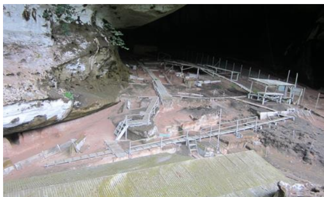
Fig. 3: The world famous site where a young girl skull dated 40,000 years ago was excavated

The excavation site which had fence around, however, was closed to visitors. Only a signage (Figure 4) wired to the fence indicated the site importance. There was no more excavation. If an interest from the Sarawak Museum to carry further exploration exists, they simply didn't have the money to fund it (Personal interview with Sani). The guide was actually a staff of the Archaeology Museum which was located next to the jetty. He takes turn with his colleague at the Archaeology Museum to clean the excavation site, particularly from fallen leaves as the site is at the western edge of the main entrance to the cave complex