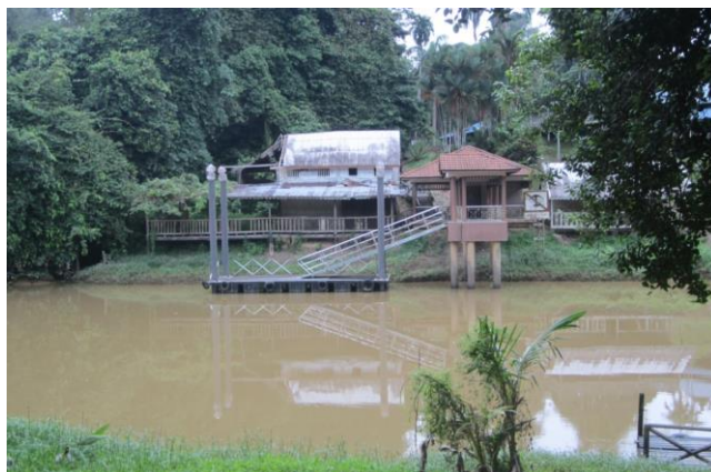
Fig. 1: Jetty where one disembark to continue tracking to Niah Caves

The morning of 1st February 2017, we crossed the not-so-wide Niah River on a boat steered by a boatman, Mr Jamak. Jamak acknowledged that a couple of days back he saw a crocodile, a juvenile, soaking the sun on the riverbank just a bit upstream from where we crossed. A sign nearby the embarking jetty with a drawing of the reptilian also served as a precautionary measure for visitors. Figure 1 shows the jetty where the authors disembarked on the other side of the river, whereby the Archaeology Museum was located. Meeting our guide Mr Sani at the Archaeology Museum on the other side of the river, we rented head lights from the museum, and borrowed rain coats and umbrella from the staff who manned the museum.