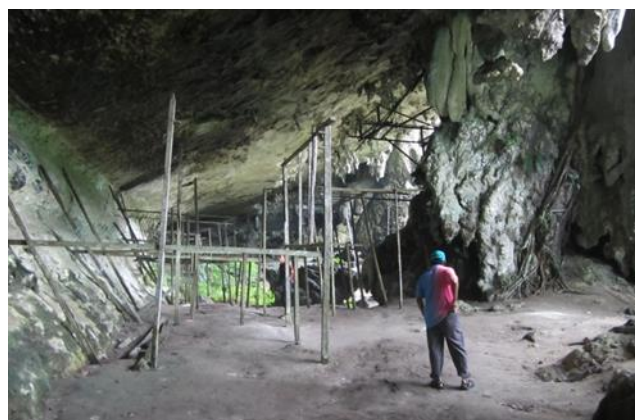
Fig 6: Trader's cave, a name synonymous to heyday activities

Trading for edible bird nests has been going on for decades at Niah Caves. One section of the Niah Caves known as the Trader Cave (Gua Dagang) are full of old timber structures resembling former makeshift stalls where trading on the edible nest was made (see figure 6). A photo taken in 1959 encapsulated in a solitary signage at the Trader Cave shows traders who stayed and lived in these premises almost 60 years ago. This tells us that the place was busy during its heyday. Malaysia produced 135 metric tons of edible birds' nests amounting to RM1 billion from 2010 to 2012 (Manan & Othman, 2012). However, the nests are mainly produced from swiftlet farms and houses constructed specifically to house the swiftlets (Awang, Hassan, & Abdullah, 2013, 2014; Wong, 2017). These houses dotted the urban and rural landscape in Malaysia. The houses, nonetheless, are not open to public. Visits, apart from occasional harvesting periods would have the tendency to disturb swiftlet's habitat and possibly induce the birds to leave the houses.