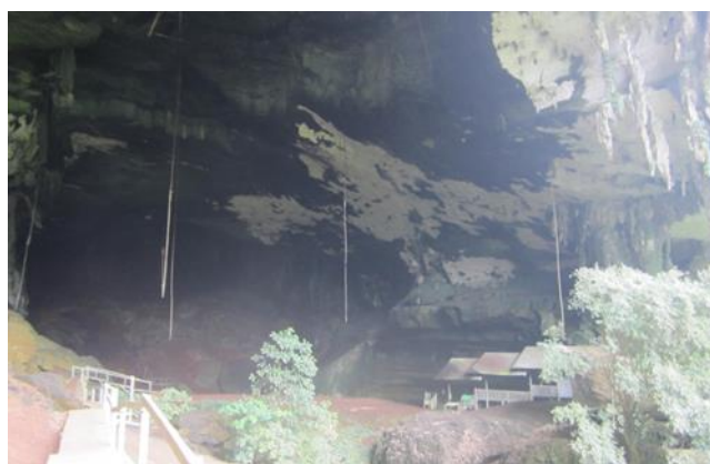
Fig 5: Ropes dangling from caves' ceiling and holes

As such the nests have high commercial value. However, not all species of swiftlets produce nests that are edible. Out of 24 swiftlet species that are found in this world, only a few produce edible