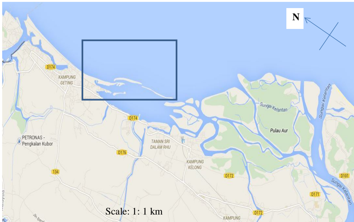
Figure 1. Study area in Sri Tujoh Lagoon, Tumpat, Kelantan, Malaysia.

(13) stations were selected as the sampling points. Geographical coordinates of sampling sites were marked using a Global Positioning System (GPS) (Table 1).