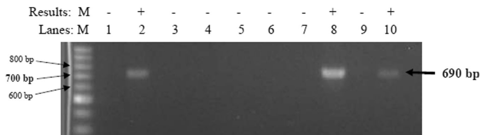
Fig. 1 Pigs 4 and 5 PCR assay carried out using specific primers targeting the NS1 gene to produce 690-bp PCR products. Electrophoresis was carried out on 1.5% agarose gel for 45 min. Positive samples are observed

This study has described for the first time porcine bocavirus in swine herds in Malaysia. Albeit a small sample size was obtained through the convenience sampling method, a high prevalence of 90.9% was observed.