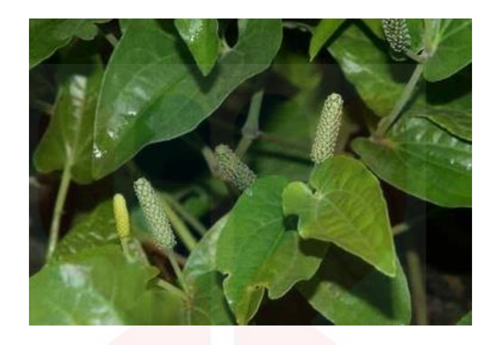
Figure 2.1 : Long Pepper ( Piper longum ) for medicinal uses