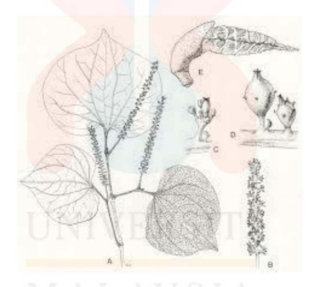
Figure 2.3: Part of Piperaceae species

The Piperaceae life cycle is based on piperales which is order of dicot that flowering plants which contains of herbs, small tress and shrub. The small flowers that clustered together shown the characteristics of this order which in cone shaped structures (Watkins et al., 2006). Meanwhile, for the habitat of family Piperaceae which is mostly live in tropical, foliated, warm and places that was shady. In addition, the pepper vines shown the characteristics of the genus of Piper plant.