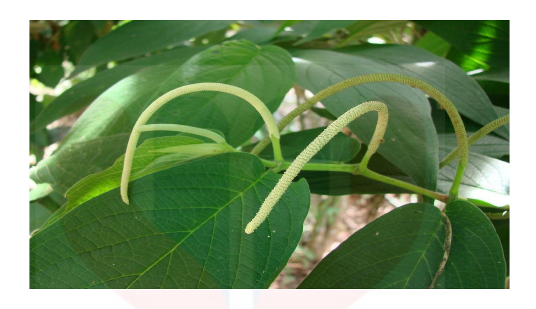
Figure 1.3: Piper aduncum used for medicines and agro-forestry