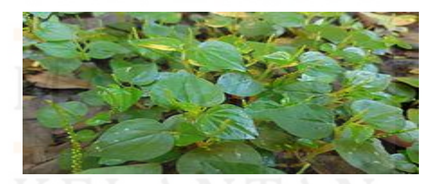
Figure 1.2: Peperomia pellucida used for medicinal use

From this research, it was expected to provide more data and advantages on the Piperaceae family and can gain the data checklist of the Piperaceae family population. The factor that can change the Piperaceae diversity and population can also be learning and the protection of the species can be completed (Semain et al., 2008).