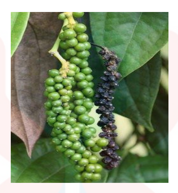
Figure 1.1: Fruits of Piper nigrum for spices