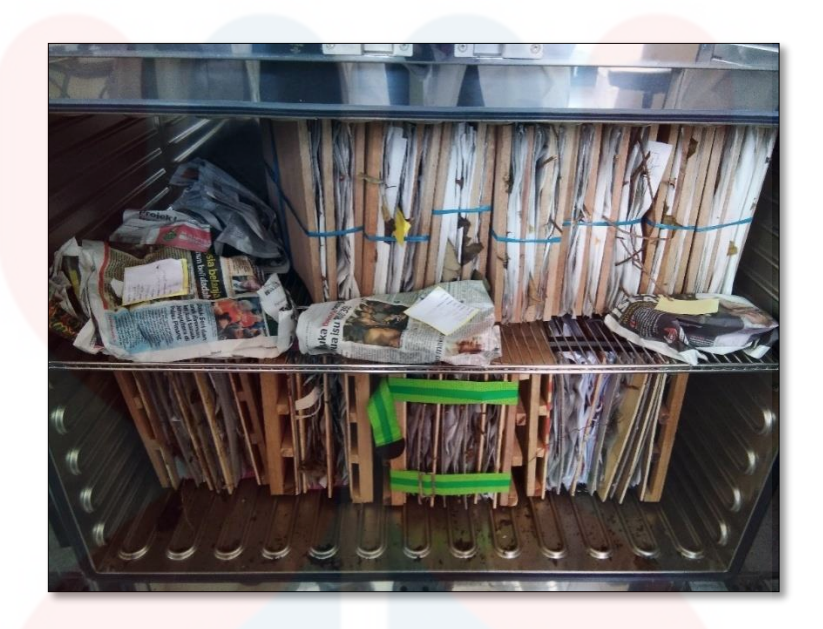
Figure 3.1: Drying process of samples in drying oven

and by referring the identification key based on books by Paris et al., (2010) in Flora of Peninsular Malaysia.