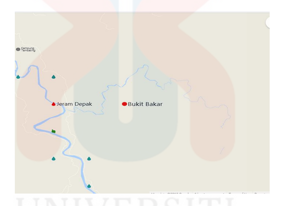
Figure 3.1: Location of Bukit Bakar Forest Eco Park

The three stages of sampling site which are in lowland, midland, and highland will be determining by using the Global Positioning System (GPS). For the latitude and longitude, to avoid or decrease the nature disruption