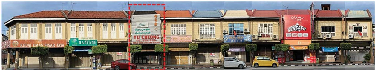
FIGURE 2. Image indicating the existing heritage building facade before revitalising on Row 1.

From the literature provided by the local authority of Kota Bharu (MPKB), the development of the heritage guidelines have been gazetted since February 2011. Yet observation and findings from this study have suggested how the implementation of heritage conservation guidelines has not been put into much practice. This section describes three key areas of identified issues in their role for heritage guideline fulfilment and continuous compliance (Figs. 2-4).