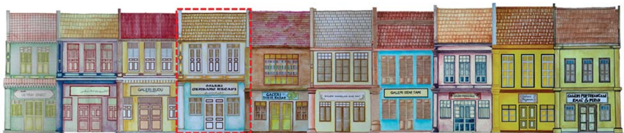
FIGURE 3. Image showing the student's proposal for heritage building signages after revitalized.