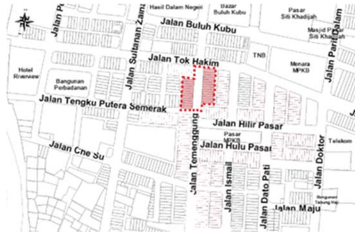
FIGURE 1. Map showing the row of the case study shophouses at Jalan Temenggung as indicated [5].